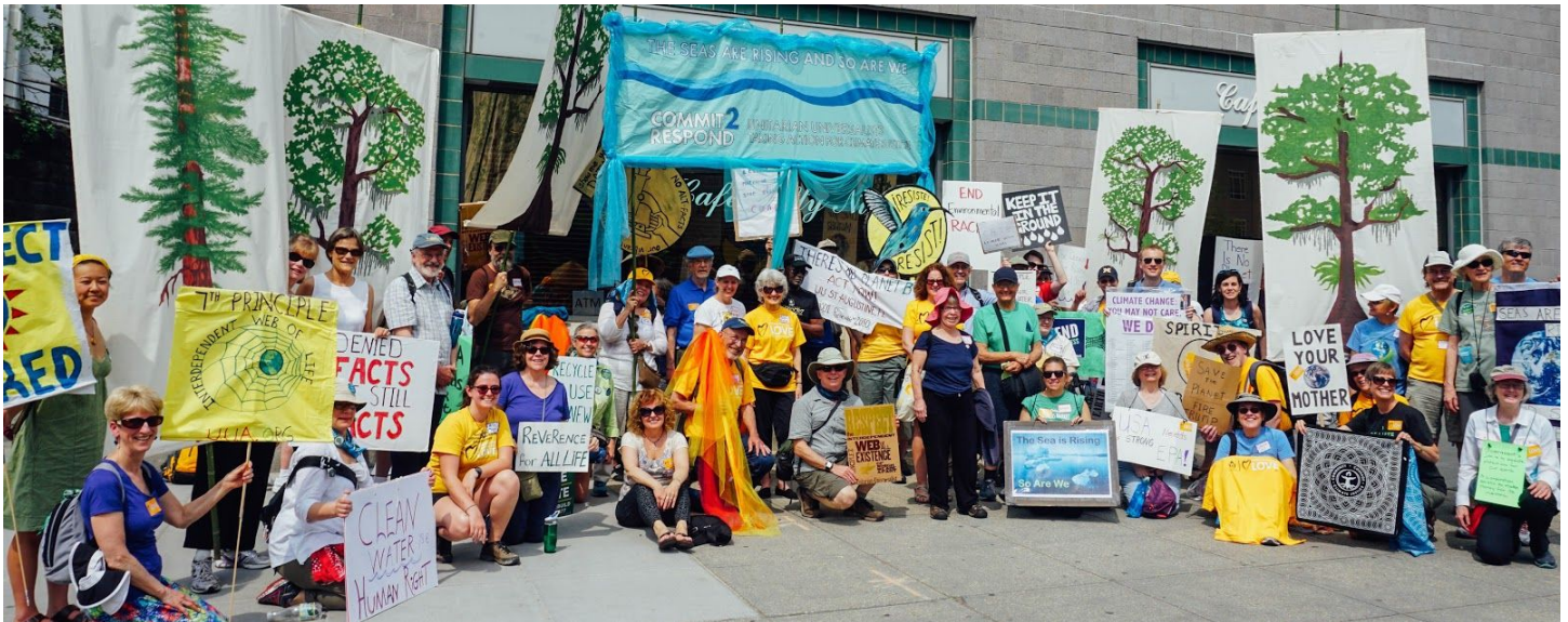
Unitarian Universalists rally together and pose for a photo before the People's Climate March in Washington, D.C., April 2017.

UUMFE is a not-for-profit, tax-exempt organization incorporated under the laws of the Commonwealth of Virginia in 2002 as the Seventh Principle Project of the UUA, now doing business as Unitarian Universalist Ministry for Earth.