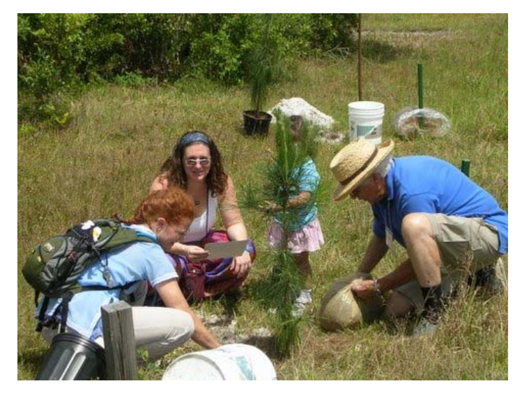
Holton Eco-Preserve, Ft. Myers, Florida Volunteers plant trees.

On Earth Day, 2006 twenty-four children joined